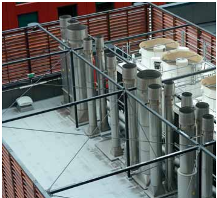
Cooling Towers on Building Roof